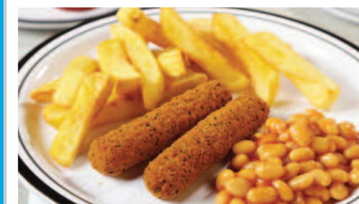
Breaded Mozzarella Sticks served with Chips & Peas or Baked Beans

VEGETARIAN VERSIONS OF THE ABOVE MEAL AVAILABLE DAILY