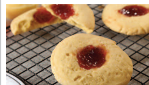
Jam & Custard Biscuit