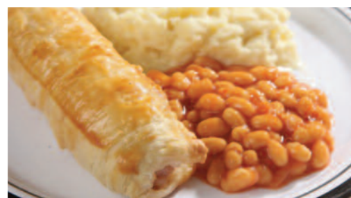
Homemade Sausage Roll served with Mashed Potato & Baked Beans