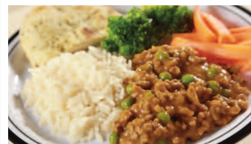
Beef Keema served with Rice, Naan Bread & Seasonal Vegetables